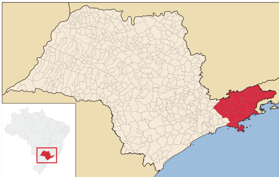
Figure 1: Metropolitan Region of Paraíba Valley and North Coast Map

This region stands out for quite diverse economic activities, in particular the automotive, aeronautical, aerospace and warlike industries. These industries are concentrated in the municipalities located in the axis of the Presidente Dutra highway (which connects São Paulo city to Rio de Janeiro). It is noteworthy that the region has other economic activities such as port and oil activities in the North Coast and tourist activities along the Mantiqueira Mountains, in the North Coast and Historic Valley.